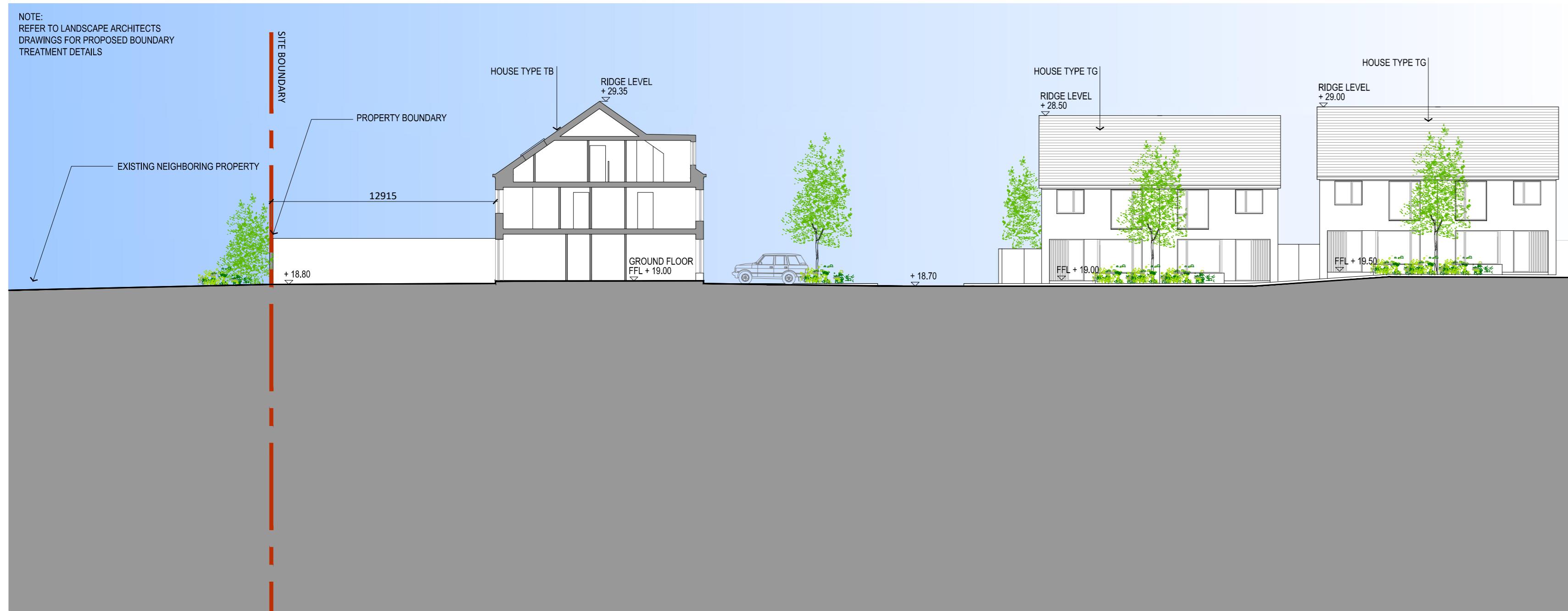
Site Section 8-8 scale 1:200