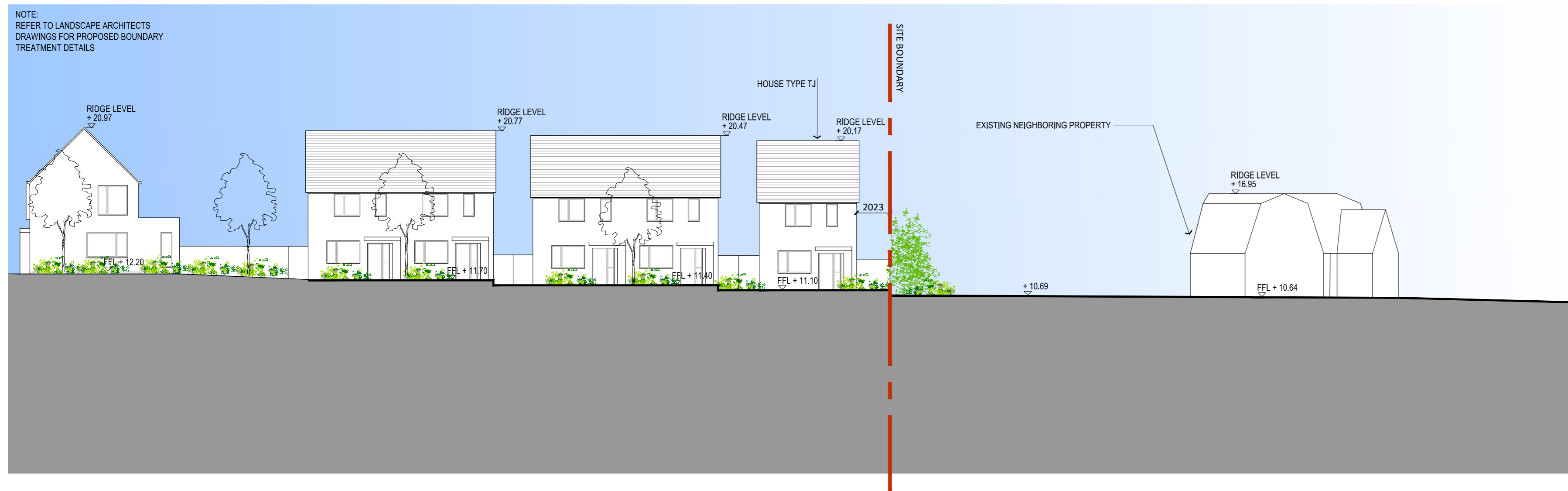
Site Section 9-9 scale 1:200